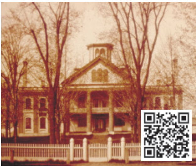
York County Courthouse Tour ► SEE PAGE 9