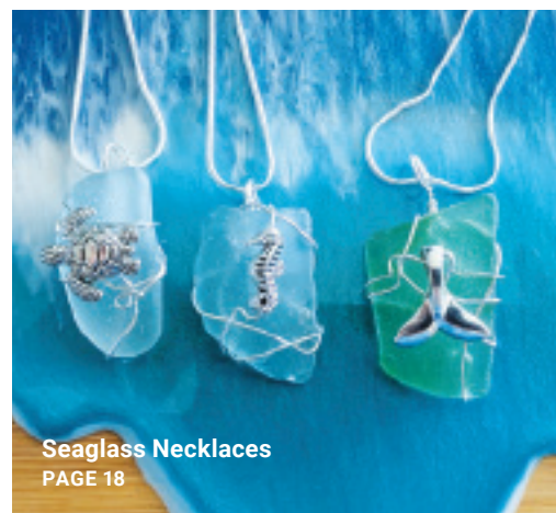
Seaglass Necklaces PAGE 18