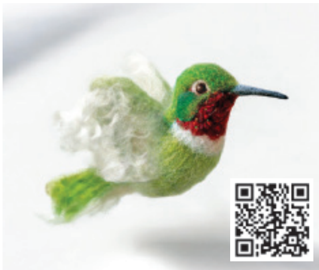
Needle-Felted Hummingbirds ► SEE PAGE 16